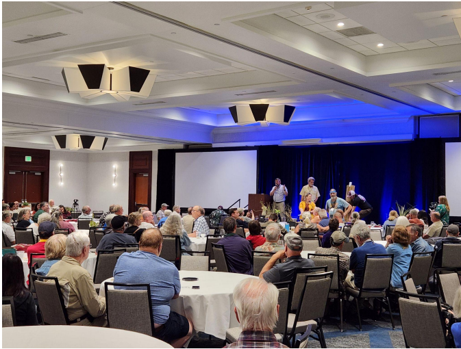
Best plant auction - EVER