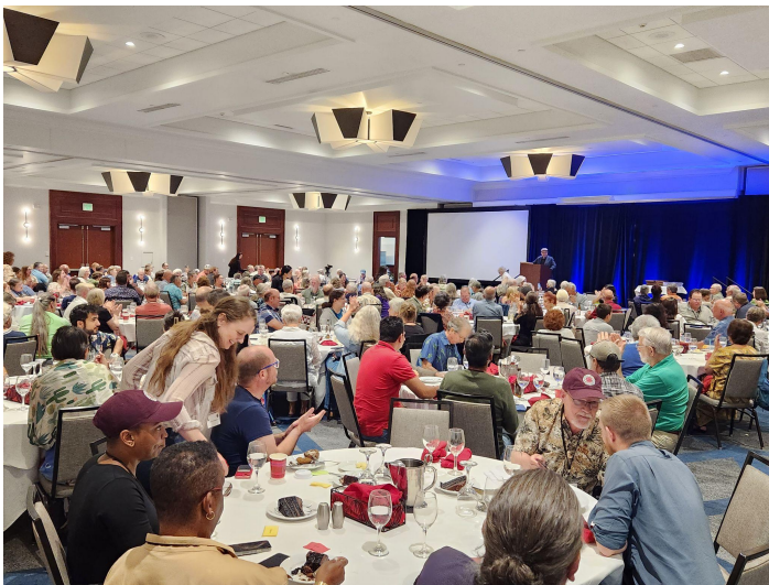
Award presentation and banquet reception.