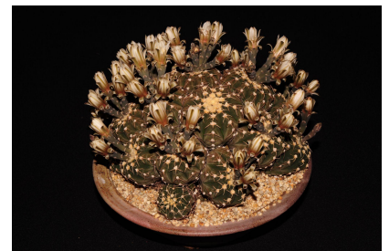
Gymn triacanthum show specimen

Gymnocalycium is one of the most popular of all of the South American genera. Most everybody during the development of their cactus and succulent collections has eventually ended up with a sizable assortment of this wonderful genus. The genus is named for its naked, spineless floral calyx, thus; Gymno (naked) calycium (calyx). Their large flowers are often very beautiful in form and color, ranging from white to yellow to red and pink. When the flowers are fertilized, the naked calyx normally develops into a large colorful fruit which becomes very attractive to the various little creatures (mice, birds, lizards, etc.) who love to eat these succulent morsels.