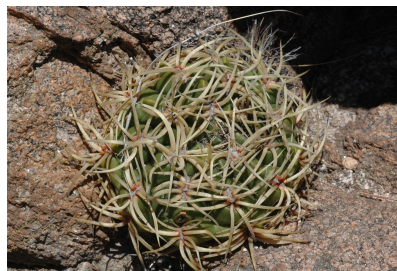
Gymn monvillei in habitat near Argentina