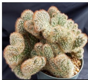
Left: Mammillaria huitsilopotchlii crest